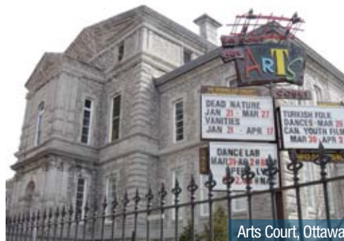
Arts Court, Ottawa

Session times, descriptions and presenters are subject to change.