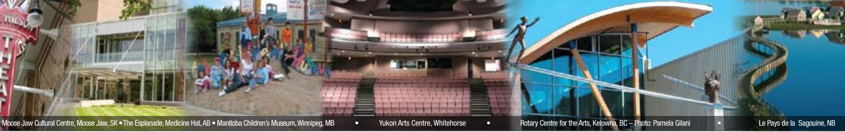
Moose Jaw Cultural Centre, Moose Jaw, SK • The Esplanade, Medicine Hat, AB • Manitoba Children's Museum, Winnipeg, MB • Yukon Arts Centre, Whitehorse • Rotary Centre for the Arts, Kelowna, BC • Le Pays de la Sagouine, NB